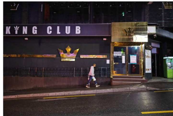
A person wearing a protective face mask walks past a closed club at night in the Itaewon area of Seoul, South Korea, on Saturday, May 9, 2020.

BY STEVEN BOROWIEC / SEOUL MAY 14, 2020 9:04 AM EDT