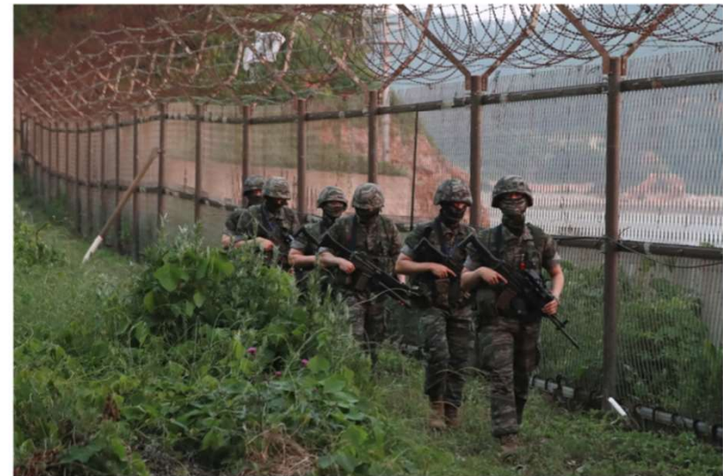
South Korean Marines patrolling on Yeonpyeong Island, South Korea, in 2020.