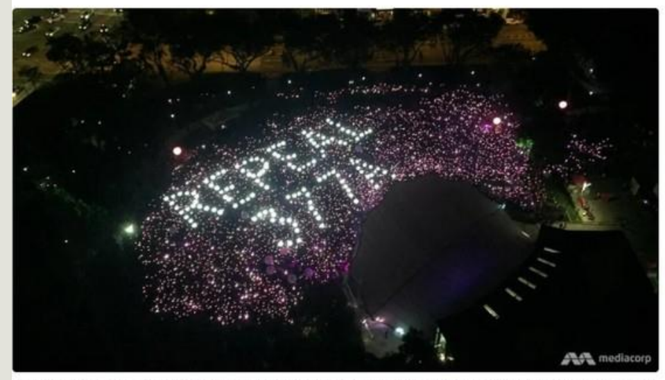
The traditional light-up for the Pink Dot event in 2019 spelt out a call to repeal Section 377A of the Penal Code, which criminalises sex between men.

Bills to repeal 377A, amend Constitution to protect definition of marriage tabled in Parliament