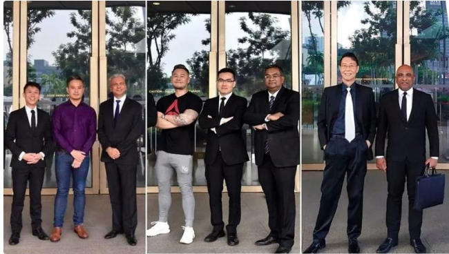
The men mounting challenges to Section 377A, and their lawyers.