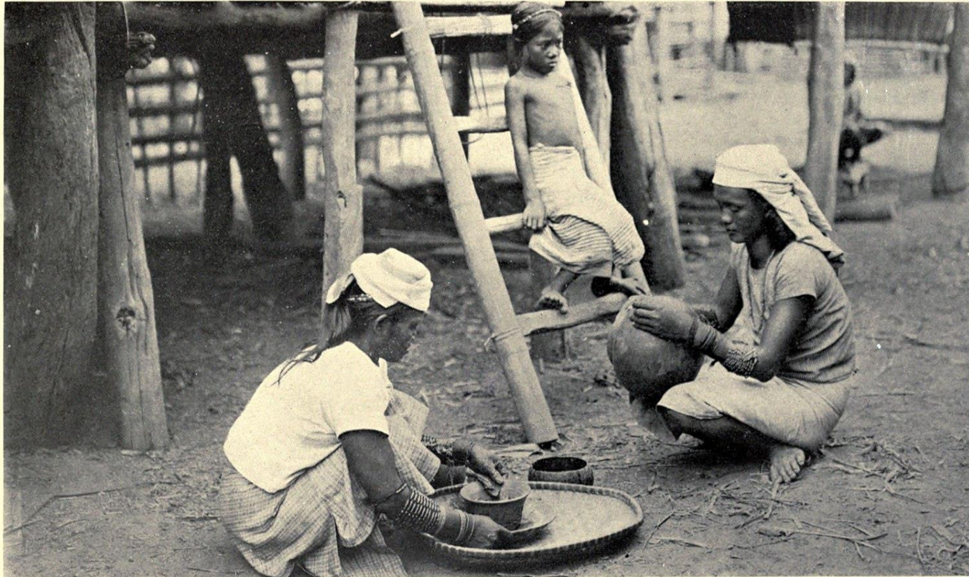
POTTERS AT WORK. THE ONE ON THE RIGHT IS A MAN IN WOMAN'S GARB (pp. 360, 428).