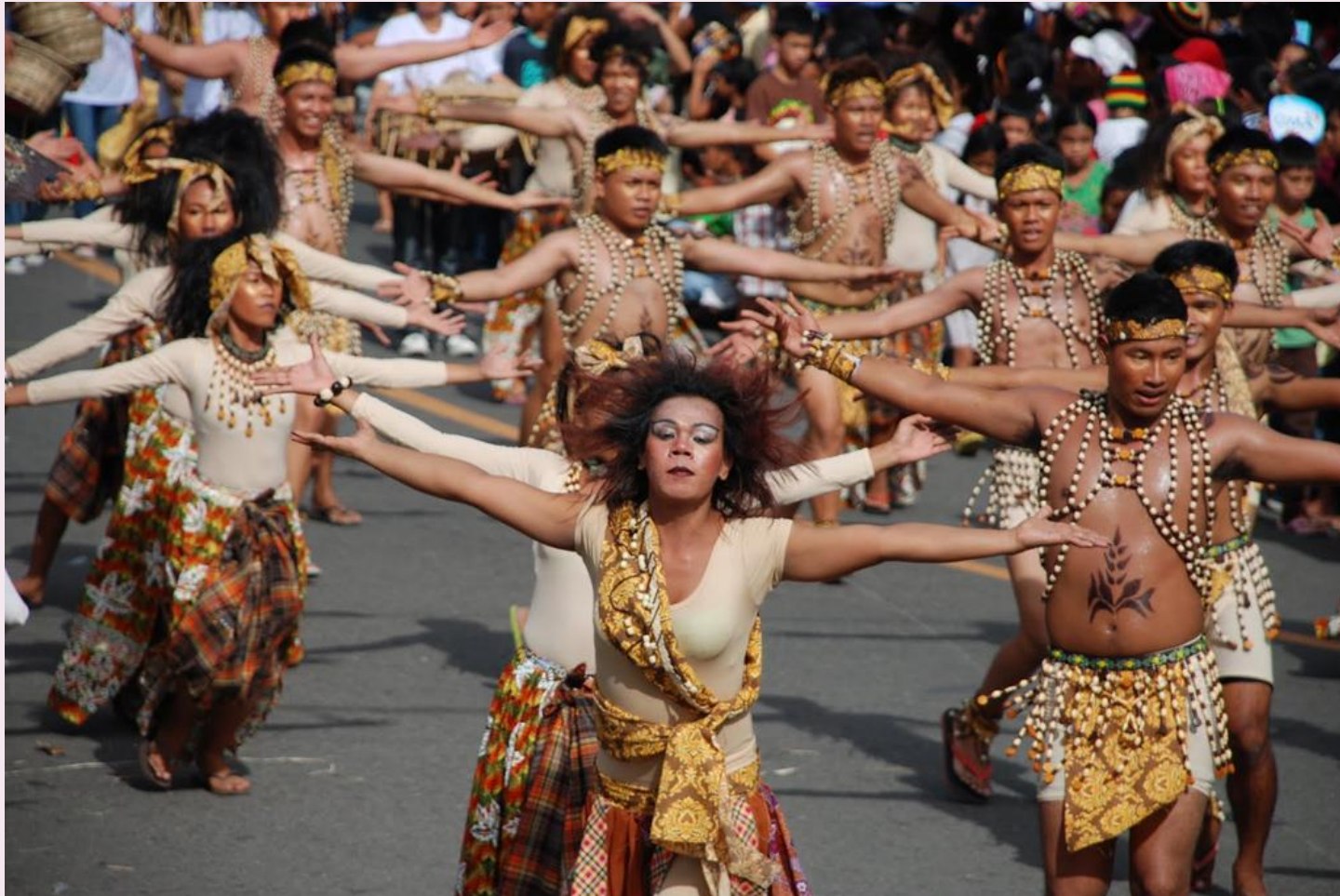
Babaylan portrayed in performance in current time