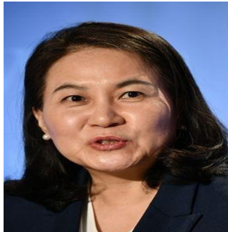
Yoo Myung-hee Ministry of Trade, South Korea