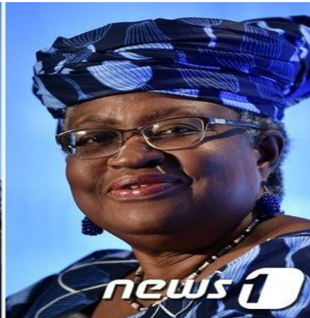
Ngozi Okonjo-Iweala Former Finance Minister, Nigeria